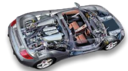
Car Engine and Internal logic is JS

We will start learning how to build beautiful websites in this course.